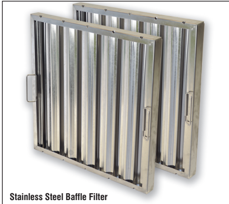
Stainless Steel Baffle Filter