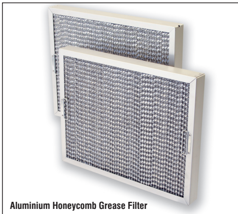
Aluminium Honeycomb Grease Filter