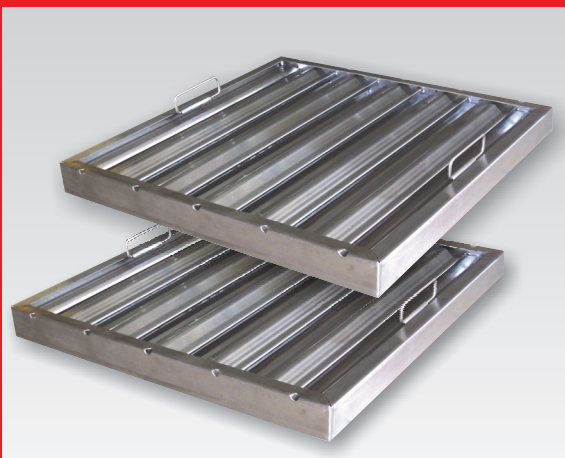
Stainless Steel Baffle Filter